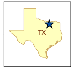
Figure 1 Phase II Summary