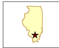
Figure 2-1 Joseph Baldwin LTA Location and Operational Range Area