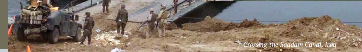
Crossing the Saddam Canal, Iraq