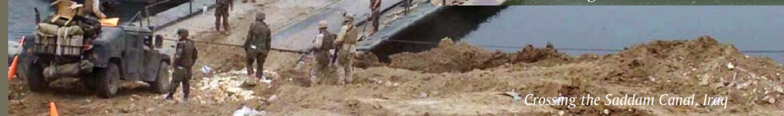
Crossing the Saddam Canal, Iraq