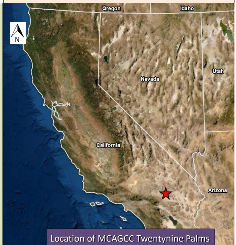
Location of MCAGCC Twentynine Palms

The operational ranges will be reassessed during the next REVA Periodic Review (5 years) or sooner if there are changes to site conditions.