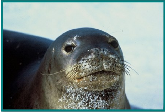
Hawaiian monk seal