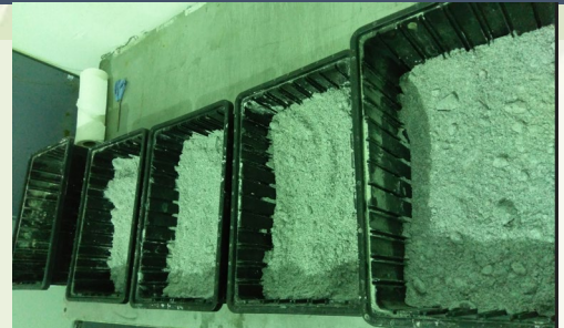
60 lbs of flare composition in trays

We have demonstrated the new composition to TRL 5 by static testing and limited cartridge level testing at a prime 40mm manufacturer. Still ahead, we will advance to higher TRLs by doing more thorough static and cartridge level testing, which will culminate in proving out the production process for the new flare technology .