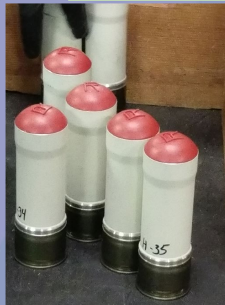
Lapped cartridges containing flares