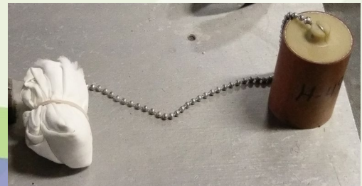
Flare composition pressed into flare with parachute mounted