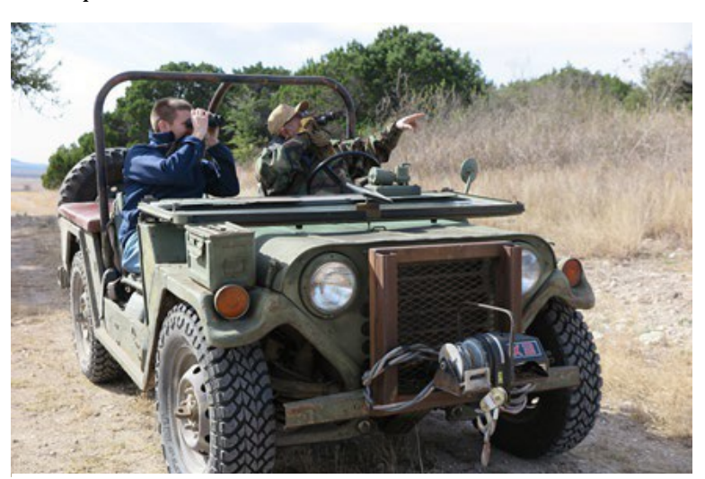
Volunteers observe birds in live fire area from a Vietnam-era jeep, Fort Hood, Texas CBC.

Fort Hood initiated their CBC in 2016. To maximize participation, Fort Hood leverages multiple conservation partnerships, which include local Audubon societies, universities, and services members. Currently, the Fort Hood CBC count circle covers the largest area of DoD land at just over 150 square miles.