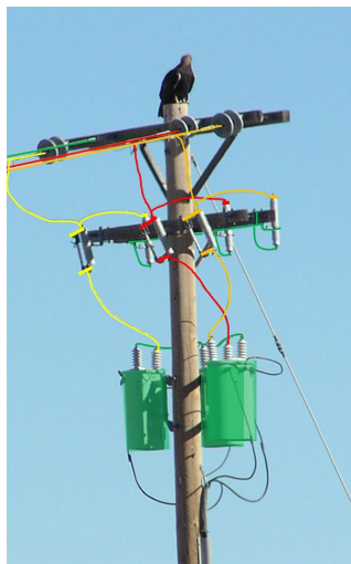
Simultaneous contact with any two different-colored lines will result in a shock or electrocution (green denotes ground potential).

security reasons and for testing and training purposes. Managed, in part, for the benefit of natural resources, these diverse habitats attract breeding, migrating, and wintering birds.