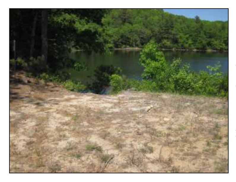
An example of an ideal nesting area for Northern Red-bellied Cooters. Note the open canopy and sandy/loamy soil with sparse grasses, as well as the short distance to the aquatic habitat.

suboptimal locations and decrease the distance nesting females need to travel over land, thus reducing the risk of road-related mortality.