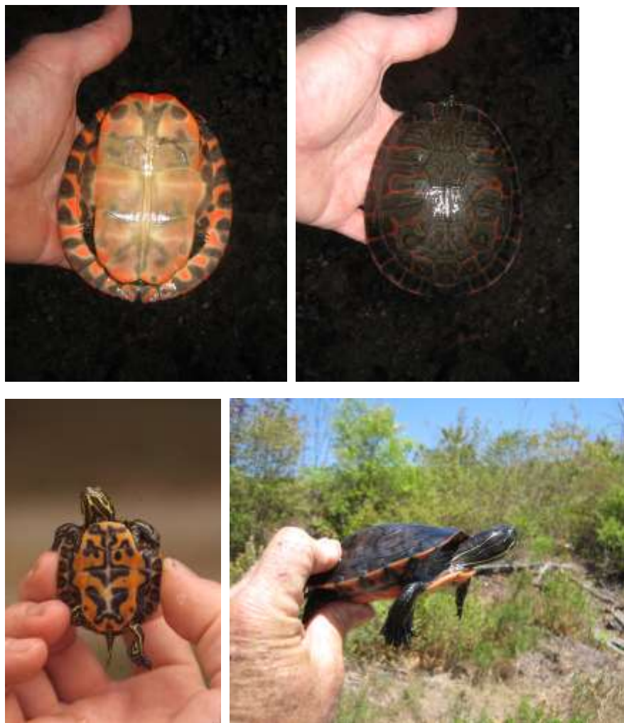
The bright plastral and carapace patterns of a juvenile Northern Red-bellied Cooter. Pictures by K.A. Buhlmann.

Plastral patterns of a hatchling Northern Redbellied Cooter (left). Head striping on a juvenile cooter (right). Pictures by K.A. Buhlmann.