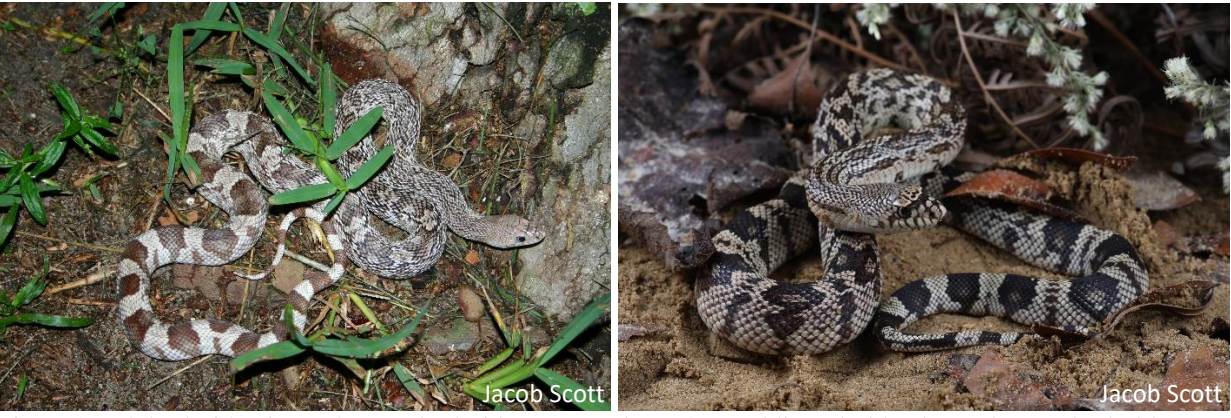
Figure 2. Adult Florida Pinesnake, south Florida