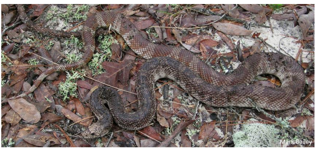
Figure 1. Adult Florida Pinesnake, south Alabama

Description: The dorsal pattern is brown to reddish blotches on a gray to sandy-colored background (Figure 1, 2, and 3). Pigmentation varies, and specimens from Florida are often lighter in color than those in the northern part of the range. Scales on the upper part of the body are keeled (ridge down the middle). Hatchlings range in total length from 15 to 24 inches (380 to 610 mm) and adults are typically 48 to 66 inches (122 to 168 cm) (Conant and Collins 1998, Hipes et al. 2000).