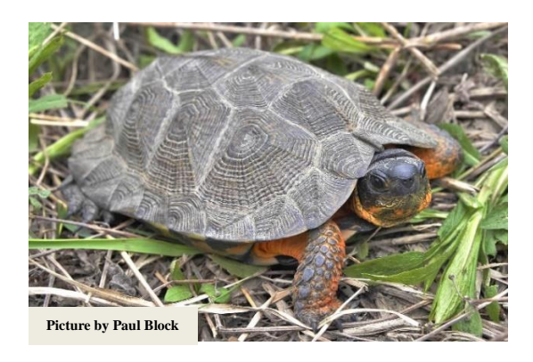
Figure 1. Wood Turtle Carapace

Adults are typically 7 to 9 inches (14-20 cm) in length. Males are larger than females and have a thicker, longer tail and prominent dermal scales on the anterior surface of the forelimbs. Wood turtles have a very rough-textured carapace (top shell) with large scutes (the individual scales covering the shell) consisting of irregular pyramids of concentric grooves and ridges (Figure 1). The plastron (lower shell) is typically yellow with large, often rectangular black markings that fade over time. The plastron is typically concave for adult males and mostly flat for adult females. The posterior edge of the plastron has a large V-shaped notch below the base of the tail (Figure 2). The rear marginal scutes past the hind legs are serrated and adjoin the lower lateral side of the carapace, whereas the front marginal scutes are smooth and form a bridge between the carapace and plastron. The head and neck are brown, yellow, or bright orange, and parts of the face, tail, and limbs may also be orange.