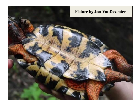
Figure 2. Wood Turtle Plastron (male)