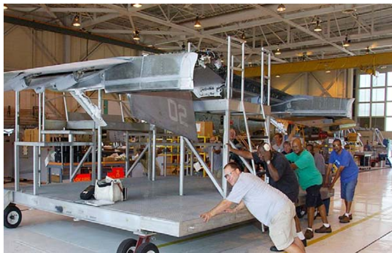
AV8 Wing Stand (It takes 11 employees to move it.)

At Fleet Readiness Center East we have to move parts of all kinds around the depot. Moving an AV8 Wing around is just one example.