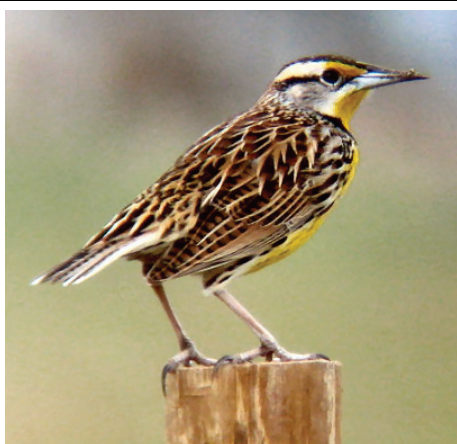
Eastern Meadowlark, a PIF species of High Regional Priority.

Scores were assigned to the 448 breeding landbird species occurring regularly in Canada and the U.S. in six biologically based “global” categories (vulnerability factors) including: Relative Abundance, Breeding and Non-breeding Distributions, Threats to Breeding and Non-breeding (Conditions), and Population Trend. A