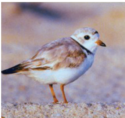
Priority species with low populations, like the Piping Plover, are more threatened by WNV.

While birds are the primary carriers of this disease, WNV has also affected a number of mammal species, such as horses, squirrels, chipmunks, bats, skunks, rabbits, mountain goats, seals – and humans. Infection with WNV is not fatal for all birds, but certain groups are apparently more susceptible than others, including corvids (crows & jays) and raptors (hawks, owls, eagles & vultures). Over 140 different species of birds are known to be affected by WNV as of spring 2003. Exotic and captive species, such as those found in zoo collections, are affected as well as wild ones.