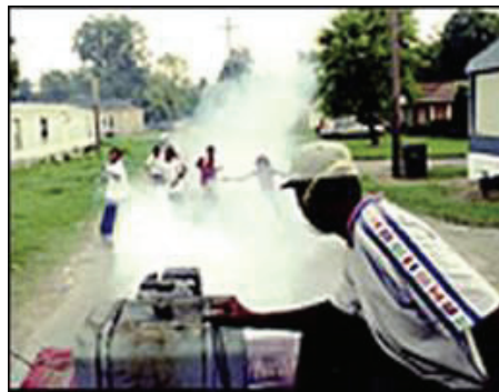
Although West Nile Virus can pose a threat to human health, wide-spread spraying of pesticides can be a greater health hazard.