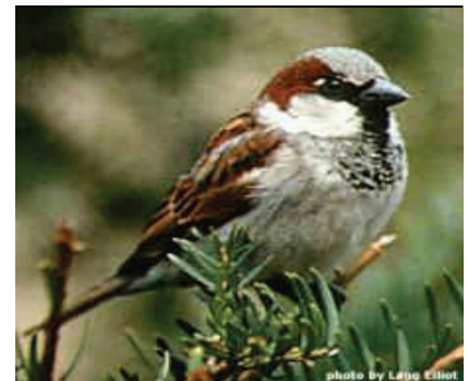
The House Sparrow is a key species in the propagation of WNV to other species.

Residents or military personnel at installations should contact the Pest Control Coordinator, the Base Medical Clinic, or the natural resources staff. If none of these exist at the installation, contact your state or local health department for their policy on the reporting or collection of dead birds. See the CDC web site link above for state and local contact information.