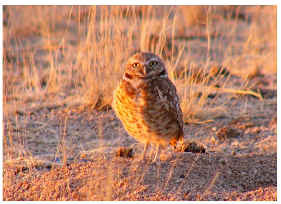
Adult Burrowing Owl on its breeding grounds at Kirtland Air Force Base, NM.

DoD manages approximately 28 million acres of land, water, and air resources across hundreds of installations; the Army Corps of Engineers manages an additional 12 million acres. These lands represent a critical network of habitats for birds, offering migratory stopover sites for resting and feeding, as well as suitable sites for nesting and rearing their young. The many installations that provide these important habitats form DoD's Steppingstones of Migration . DoD PIF is committed to ensuring that these areas, along with the species that depend on them, are protected and sustained for future generations.