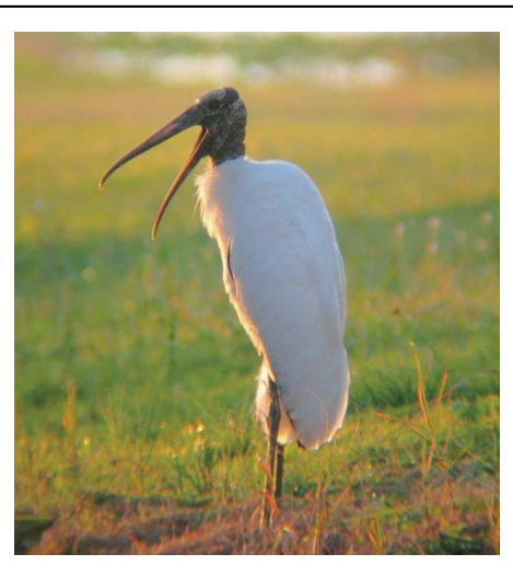
The Wood Stork is a High Concern in the Waterbird Plan, as well as being Federally Endangered.

This FWS list identifies species whose population are below long-term averages or management goals, or for which there is evidence of declining population trends. The list refers to waterfowl and migratory shore and upland game birds of management concern, and are a subset of the species (50 CFR 10.13) protected by the Migratory Bird Treaty Act.