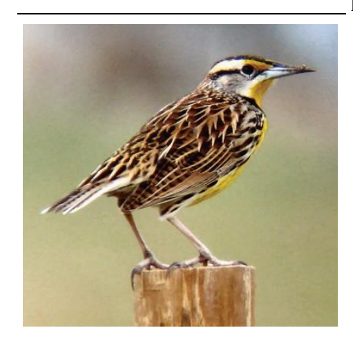
Eastern Meadowlark, a PIF species of High Regional Priority.

Scores were assigned to the 448 breeding landbird species occurring regularly in Canada and the U.S. in six biologically based "global" categories (vulnerability factors) including: Relative Abundance, Breeding and Non-breeding Distributions, Threats to Breeding and Non-breeding (Conditions), and Population Trend. A