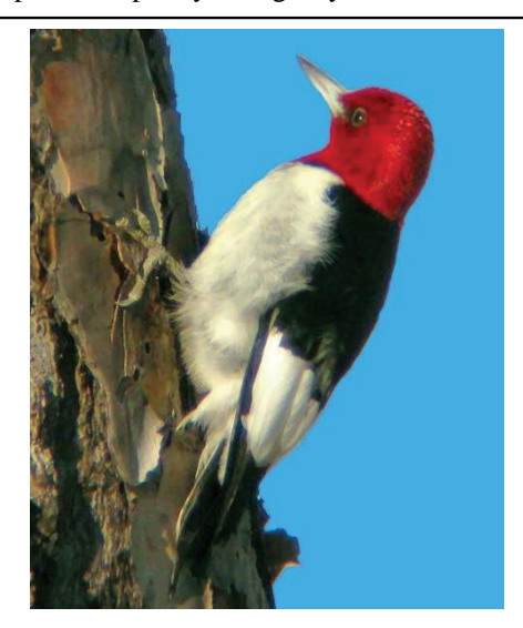
Red-headed Woodpecker is a High Overall Priority for PIF, and a Bird of Conservation in 13 BCRs and nationally.

Federal agencies to take reasonable steps to restore and enhance habitat, promote research and information exchange, incorporate migratory bird conservation into planning processes, provide training and visitor education, and develop partnerships beyond agency boundaries.