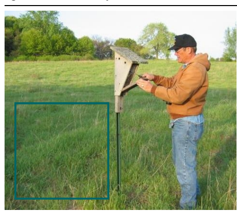
Volunteer Craig Andresen checks a clutch of Eastern Bluebird eggs at Arden Hills Army Training Site (MN).

The breeding range of the Eastern Bluebird (Sialia sialis) overlaps slightly with that of the Mountain Bluebird (S. currucoides) in the northern plains. The breeding range of the Western Bluebird (S. mexicana) lies within that of the Mountain Bluebird in the western US. Resident subspecies of Eastern and Western Bluebirds in Mexico have overlapping ranges. Within their ranges, Eastern and Mountain Bluebirds prefer open meadows or grassland areas, such as savannas or prairie-forest ecotones with groves of trees; Western Bluebirds prefer open, park-like forests, edge habitats, and burned or logged areas with sufficient snag density. All three bluebird species take readily to nest boxes.