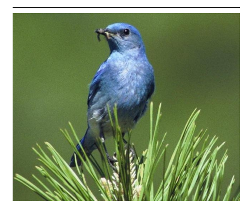
The Mountain Bluebird is a Partners in Flight priority species.

Military lands provide excellent habitat for many species of birds and other wildlife. Much of DoD's acreage is used as a safety or security buffer, and is therefore not used for active training or other activity. Areas used for active training activities are often focused on a relatively small central "core" area, but