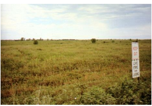
Fort Riley's (KS) 50,000 acres of native tallgrass prairie is the largest remaining contiguous habitat of this type in North America.

same year in partnership with ABC, and has been building programs state by state. As of 2004, Audubon was operating IBA programs in 46 states. Today, ABC continues its IBA program for sites of global significance, but Audubon is now the BirdLife partner designate in the U.S., and is expanding its IBA program to include sites of global and continental significance.