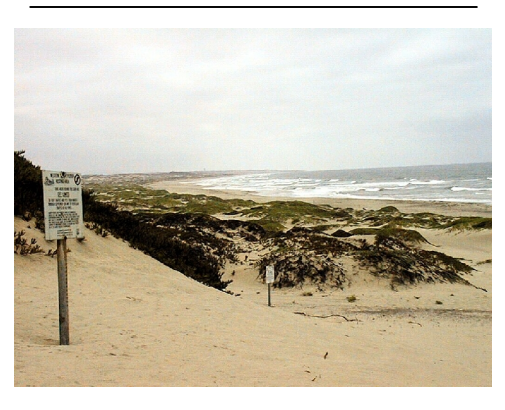
Vandenberg Air Force Base provides undisturbed beaches for nesting, wintering, and migrating shorebirds and waterbirds.

opportunities do not compromise the military mission or continued conservation actions. On military lands, IBAs can be an effective tool to engage adjoining landowners in landscape level conservation planning. Sometimes, it is the training mission itself that creates and sustains quality habitat. IBA recognition is thus an important tool to educate the public that while DoD lands are managed to support the military's training mission, they also provide significant habitat for the conservation of natural resources, including birds. When a conservation plan is desired for a network of IBAs, INRMPs and Corps comprehensive management provide alreadv the necessary information; no additional management planning is required.