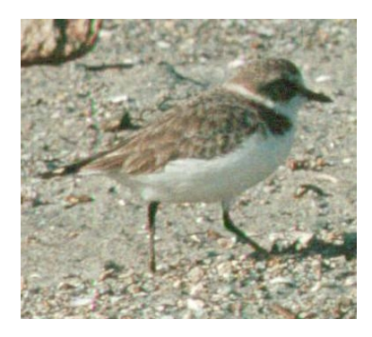
Western Snowy Plovers breed and winter on military lands in coastal California.

Any military installation or Army Corps of Engineers project is eligible to be nominated as an IBA if it potentially meets IBA criteria. Once a site is nominated, the appropriate organization reviews the nomination. If it meets the criteria, the site is identified as an IBA. Once a site has been identified, official recognition as an IBA via a ceremony or other public outreach method may take place at the discretion of the installation. A Memorandum of Understanding with American Bird Conservancy National Audubon Society outlines the expected procedures to be followed for the IBA process on DoD lands. DoD sites recognized as IBAs may receive a certificate and sign.