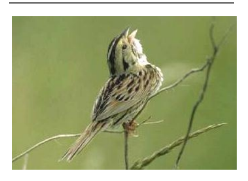
Henslow's Sparrow, a Watch List species, thrives on U.S. military installations.

Ultimately, by identifying high quality habitats and recognizing them as being important for birds, the IBA Program seeks to mobilize the resources needed to protect these areas by raising public awareness of their significance. With over 71 million Americans who watch and/or feed birds, the public is a powerful constituency for conservation. An important distinction should also be made that an IBA is not necessarily an important birding area. An IBA exists for birds, not for bird watchers. IBAs can include Watchable Wildlife opportunities, but only if such