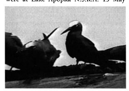
The Dry Tortugas of Florida have visiting Black Noddies nearly every year, but adults are rarely seen. This adult Black (right) with a Brown Noddy was at Garden Key 13 April 2005.