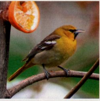
This Bullock's Oriole was present on 16 May 2005 at Hancock, Houghton County, Michigan, furnishing just the third record of this species for the state.