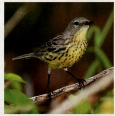
Furnishing the third verifiable record for Florida was this female Kirtland's Warbler at Fort De Soto Park 10 May 2005; the other records were from 17 October 1999 and 27 April 1896!