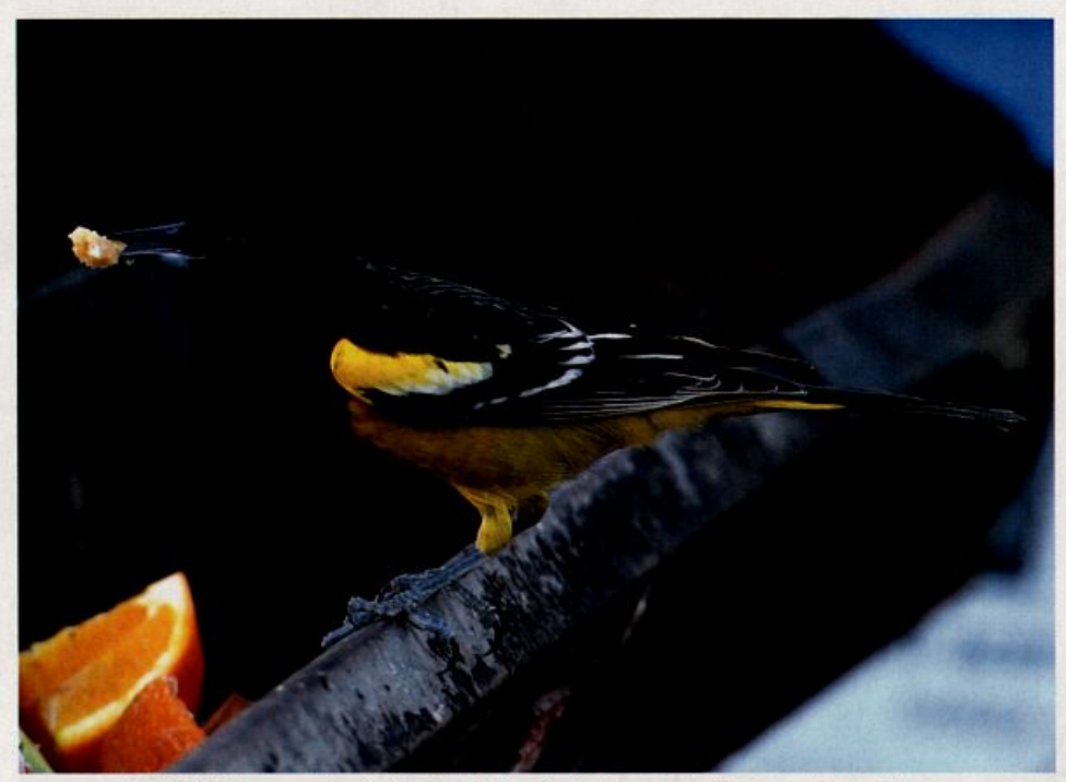
Scott's Oriole is rare anywhere in the Central Southern Region. Discovered in Montgomery County, Arkansas 15 February 2005, this state first was beautifully documented there 28 March.