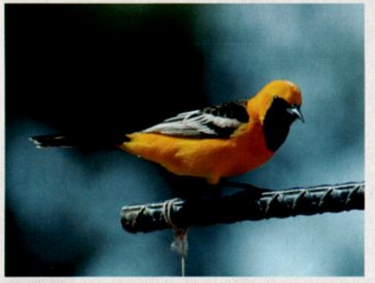
This brilliant male Hooded Oriole—at least 2500 km beyond its range was at Marsh Lake, Yukon 12 May 2005. It provided a first Yukon record and one of just a few for Canada.