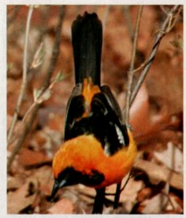
A Hooded Oriole present 6-10 (here 7) May 2005 at the photographer's residence in Clare County, Michigan provided a first state record. Interestingly, a Hooded Oriole was reported from Ontario within days of this bird's departure.