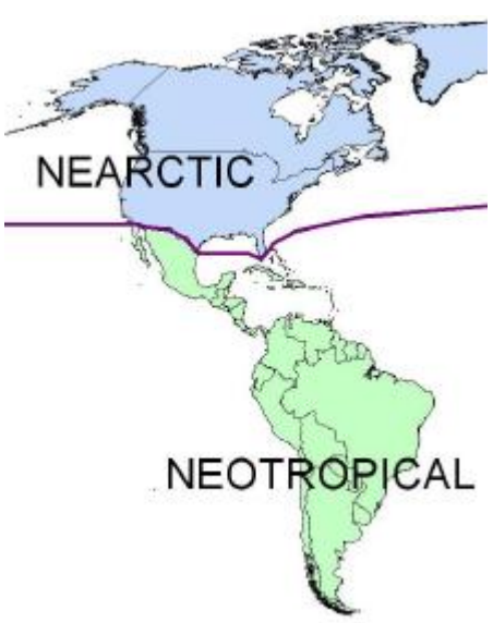
The U.S.-Mexico border is the approximate boundary between the nearctic and neotropical ecological regions.

Habitat destruction and disturbance are the primary threats to West Indian birds. Over the past several centuries, approximately 9 out of 10 avian extinctions have been of endemic island species. Many neotropical migrants share these same habitats and are also adversely affected by their