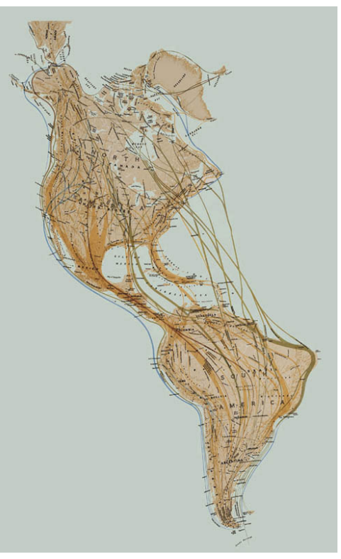
Migrations routes of neotropical migrants. Map: National Geographic Society

Survival) . Nearly 170 bird species have now been recorded on the base, including nine Cuban endemics.