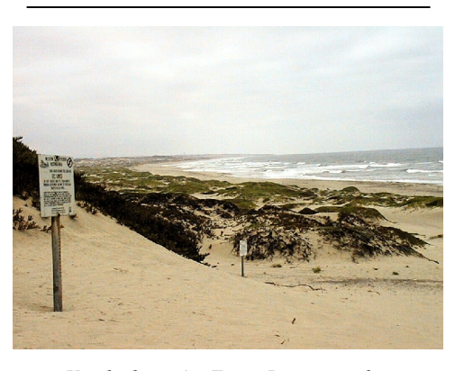
Vandenberg Air Force Base provides undisturbed beaches for nesting, wintering, and migrating shorebirds and waterbirds.

opportunities do not compromise the military mission or continued conservation actions. On military lands, IBAs can be an effective tool to engage adjoining landowners in landscape level conservation planning. Sometimes, it is the training mission itself that creates and sustains quality habitat. IBA recognition is thus an important tool to educate the public that while DoD lands are managed to support the military's training mission, they also provide significant habitat for the conservation of natural resources, including birds. When a conservation plan is desired for a network of IBAs, INRMPs and Corps comprehensive management provide already the necessary information; no additional management planning is required.