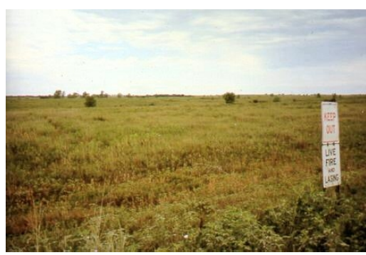
Fort Riley's (KS) 50,000 acres of native tallgrass prairie is the largest remaining contiguous habitat of this type in North America.

same year in partnership with ABC, and has been building programs state by state. As of 2004, Audubon was operating IBA programs in 46 states. Today, ABC continues its IBA program for sites of global significance, but Audubon is now the BirdLife partner designate in the U.S., and is expanding its IBA program to include sites of global and continental significance.