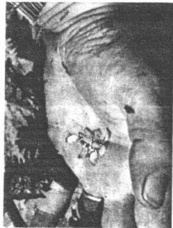
Fire pops pine cones and releases these tiny seeds almost instantly.

Only about 1,000 Kirtland's warblers exist, experts estimate. They nest primarily in the region of the Au Sabie River valley in Michigan. As forests mature,