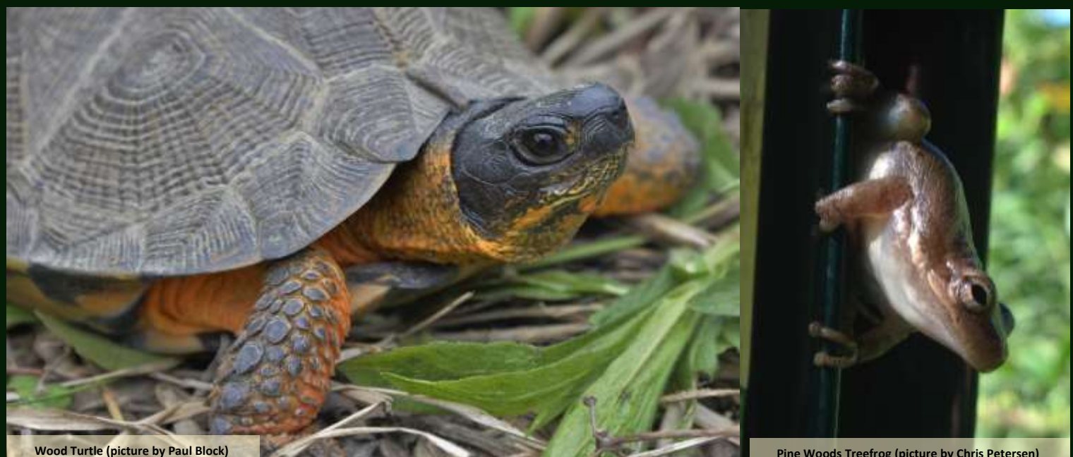
Pine Woods Treefrog

Educating military and civilian personnel about the herpetofauna on the military bases where they work and live is vital to successful species conservation. This year, we developed over 20 fact sheets on a variety of at-risk and common amphibian and reptile species confirmed on military lands. We will continue to create more fact sheets in 2018 as we work towards reaching our goal of developing a fact sheet for each of the 50 most common amphibian and reptile species confirmed present on military lands. Fact Sheets are distributed twice monthly through our listerv and are posted on the DoD Natural Resources Portal: http://www.dodnaturalresources.net/PARC-Resources.html.