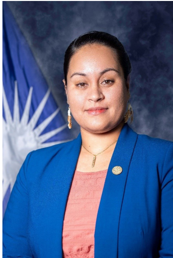
Honorable Kitlang Kabua | Senator, Kwajalein Atoll

Nitijela (Parliament), Republic of the Marshall Islands