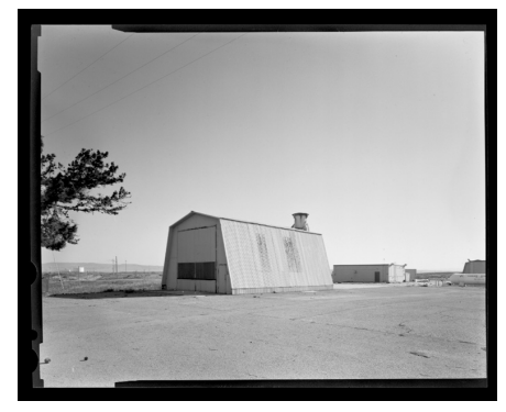
Building on Vandenberg Space Force Base.

The capability of the HABS/HAER program at the TCX will expand in 2024 with the purchase of a second camera and training of additional photography teams. Any government agency can hire the TCX on a reimbursable basis. The TCX is proud to be a contributor to our Nation's rich architectural library. For more information contact us at: <u>https://www.nws.usace.army.mil/Business-With-Us/Historic-Preservation/</u>. For more information about the LOC HABS/HAER collection, please visit: <u>https://www.loc.gov/pictures/item/2009632512/</u>.