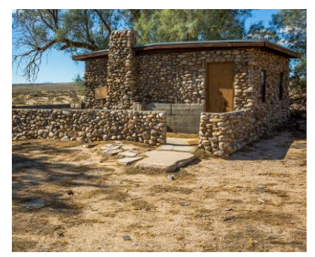
Conservation Law Enforcement Officers protect natural and cultural resources at Surprise Springs archaeological site through law enforcement.

DoD partnered with the National Preservation Institute (NPI) through a cooperative agreement to fund the Nationwide Approach to NHPA Section 110 Survey Project. NPI will work with the Miliary Departments (MILDEPs) CRM leadership to develop high-priority projects to identify and evaluate historic properties. Section 110 projects are strategic and address long-term efforts to identify and evaluate historic properties under an agency's stewardship. At present DoD has surveyed 49% of its land (approximately 10 million acres) and 71% of its real property assets over fifty years of age (approximately 95,000 assets).