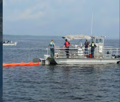
RCRS personnel set surface water POL boom during training exercise.

In a recent training exercise (May 2014), the MCB CAMLEJ FRT was awarded a Certificate of Commendation for exceptional performance. The team was recognized by the Naval Facilities Engineering and Expeditionary Warfare Center, "The facility response team at MCB CAMLEJ is...one of the best FRTs I have had a chance to work with. Their execution, teamwork and attention to detail was outstanding."