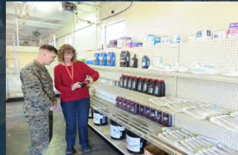
The HMRF provides viable HM items to approved customers at no purchase cost.

Though previously closed due to lack of manpower, the facility was re-opened in March 2012 and is currently staffed by RCRS personnel. The HMRF is operated as a P2 initiative in efforts to divert useable HM from the HW stream. The HMRF has become the first stop for many work centers on base in need of