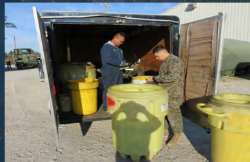
Staff from the MCB CAMLEJ RCRS pick up HM and HW from units aboard the Base.

Programs such as Curbside HM Pickup, has saved tens of thousands of manhours during the achievement period. The time required by Marines and Sailors to collect and manage excess and empty HM, was instead used to enhance mission readiness by allowing these troops to focus on training and mission essential tasks. Reuse and recycling efforts such as operation of the Hazardous Material Reissue Facility (HMRF) and recycling of used oil and fuel have saved hundreds of thousands of dollars in procurement of new HM and disposal of HW. The expansion of the Hazardous Material Consolidation Program (HCP) has increased cradle-to-grave visibility of HM, and has also supported the Base and Department of Defense (DOD) Strategic Sustainability Performance Plan (SSPP). Lastly, programs such as the MCTFER (Military-Civilian Task Force for Emergency Response) have demonstrated RCRS's desire to "go beyond the fenceline" to ensure the partnership between community and military continue to foster a successful mission environment.