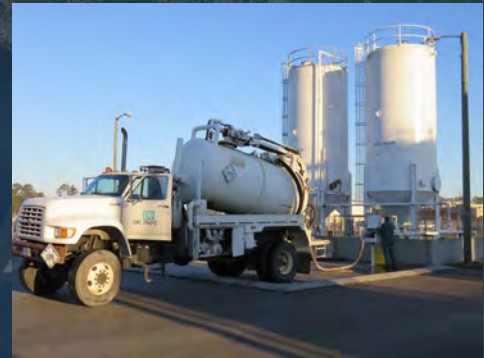
During the award period, MCB Camp Lejeune recycled 63,096 gallons of used fuel and 146,317 gallons of used oil.

The Pollution Abatement and Recovery Section (PAS) of the RCRS recovers, collects and recycles off-specification fuel and used oil which have both avoided waste disposal costs and yielded a positive revenue return. Unused fuel from training operations is another issue being addressed by RCRS; presently the unused fuel is sold for $1.43 gallon as MCB CAMLEJ has no facilities to store the fuel for reuse on site. RCRS has coordinated with the MCBCL fuel vendor to install or use an existing tank so that unused field training fuel can be stored on-site for reissue, eliminating the off-site transfer of the material. During the award period, MCB CAMLEJ recovered 63,096 gallons of off-specification fuel. If it were to be disposed of as HW, it would cost the Base $14,512 in disposal costs. Instead, the fuel was sold to a recovery company and $90,227 were received by Defense Energy Support Center (DESC).