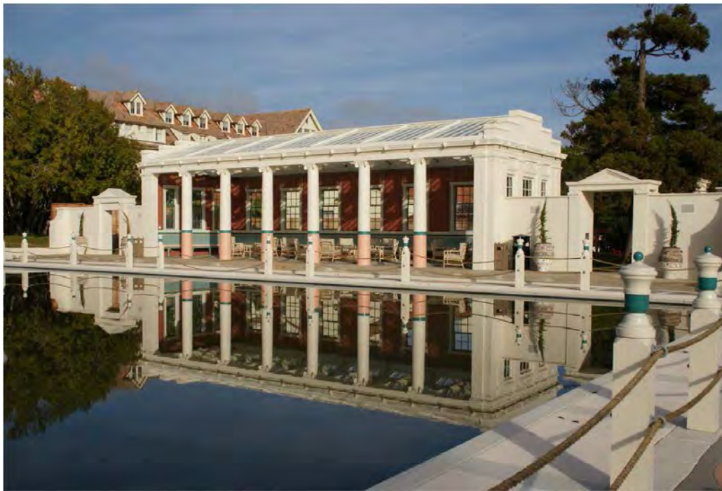
Roman Plunge Pool 2012

The Roman Plunge Pool Complex is an outstanding example of active stewardship of a historic property with significance for its historic associations and design. The Navy's stated goal regarding historic buildings and structures is adaptive reuse. The Roman Plunge Pool project represents a success of cooperation and planning, research and design, and the balance that can exist between sensitive historic resources and contemporary reuse. After two years of thoughtful research, analysis, and informed design, the final product is a fully restored early-20th century architectural masterpiece that will allow future generations insight into the pre-Navy period of the Hotel del Monte. The newly restored facility provides a venue for command functions and MWR events.