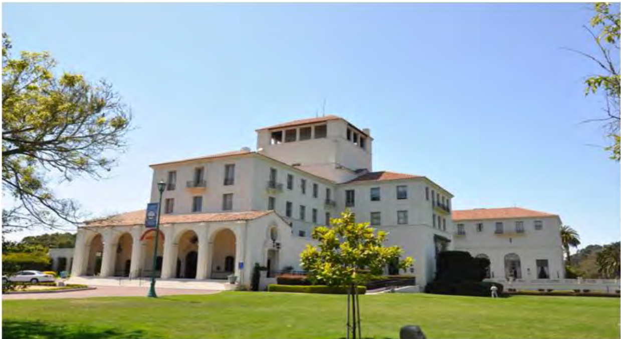
Herrmann Hall, formally the historic Hotel del Monte , at NSA Monterey.

The 4,035 military, civilian and international personnel at the base provide a diverse background for this predominately academic setting of over 160 buildings enclosing nearly 19 million square feet on almost 1000 acres.