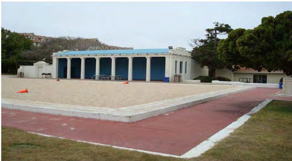
Roman Plunge Pool 2009

The Navy took ownership of the Hotel Del Monte and its environs in the early 1940s. For many years, the Roman Plunge Pool Complex served its recreational and event function for Navy and civilian personnel. Over time, various alterations, additions, demolitions, and decisions affected the historic character of the pool. By 2001, the Roman Plunge barely resembled its former grandeur.