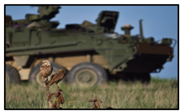
Burrowing owls protected during Stryker training on PCMS.

The MSST takes a comprehensive approach of integration and collaboration, to support mission sensitive species. The team employs proactive measures to reduce the likelihood of a species being listed by defining and managing core habitats, while maximizing open space to support training. The goal of the MSST is to enable military readiness through dynamic, integrated, innovative, and cost-effective habitat restoration and management projects. These efforts facilitate sustainable rangelands and allow for the highest quality of training for Soldiers.