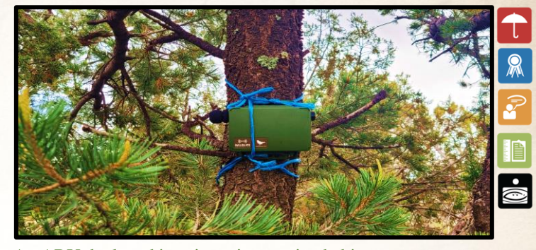
An ARU deployed in prime pinyon-pine habitat.

The pinyon jay occurs in low elevation conifer woodlands on Fort Carrson and has been historically observed on PCMS. Pinyon jays have coevolved with pinyon pines. The jays rely on the trees for food, and conversely, the jays disperse the pinyon seeds. Pinyon jays have been declining at a rate of 2%/year since 1967 (~80% decline). They are a USFWS petitioned species and a DoD missionsensitive species. Bird Conservation Region 16, the region from Fort Carson to Four Corners (UT, AZ, NM and CO), is estimated to have 50% of the population. The MSST has been conducting pinyon jay surveys and mapping their occurrence on the installation. In addition to visual surveys, the MSST has deployed 15 acoustic recording units (ARUs) in prime habitats. Data obtained from the ARUs is analyzed for the presence of pinyon jay calls.