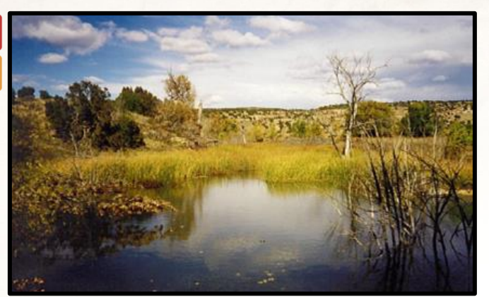
Potential black rail habitat on Fort Carson.

Black rails are elusive wetland birds with dark speckled plumage that blends perfectly into the shadows. Although black rails are rarely seen, they have a distinct "keek-ee-do" call that is most often heard at night. The black rail population has declined by 50% over the past 50 years and it is now Federally listed. Although the reason for the decline is not certain, loss of habitat and climate change are likely culprits. For three years, Fort Carson has been intensely surveying for black rails. Surveys included nocturnal surveys (using the FoxPro playback device), visual surveys, and the deployment of ARUs throughout Fort Carson wetlands. During the three years, only one black rail was recorded. This individual bird responded to a playback call and was visually identified.