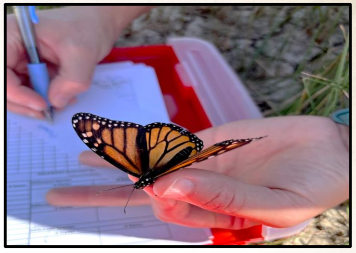
MSST and MJV collaborate to survey for monarchs.

With the locations of the butterflies documented, the MSST coordinates with the Fort Carson Fire Department (FCFD) to ensure prescribed burns are carefully timed to avoid impacts to both monarchs and their food source. Additionally, the MSST collaborates with Range Control to suspend mowing in areas where monarchs are actively breeding. The MSST biologists partner with the Integrated Training Area Management (ITAM) program to confirm that milkweeds and flowers are included in restoration seed mixes which increases redundancy on the landscape to buffer against military training and other disturbances.