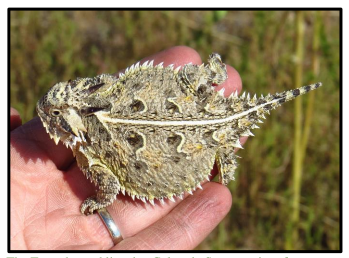
The Texas horned lizard, a Colorado State species of concern, documented on PCMS.

The MSST has partnered with DoD Partners in Amphibian and Reptile Conservation (PARC). While conducting COCW and other reptile surveys, the biologists upload data to the PARC HerpMapper Program for all reptiles encountered. This information sharing between installations is mutually beneficial. The larger set of data enables biologists to identify trends across an entire region and therefore develop more informed management strategies. Additionally, the data sharing effort enables biologists to detect trends that are unique to their installation.