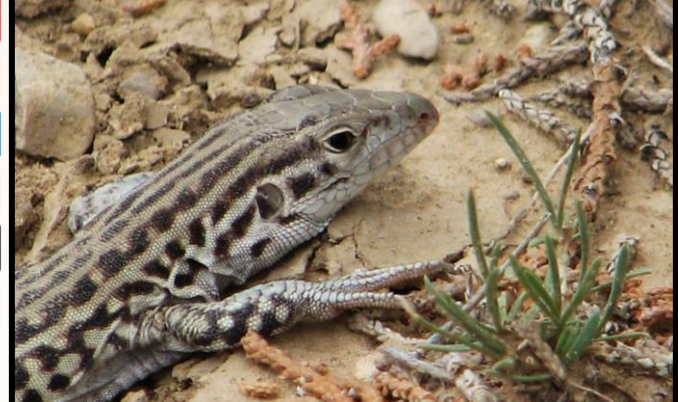
Colorado checkered whiptail foraging on PCMS.

The Colorado checkered whiptail (COCW) is a stateendemic reptile with significant populations on the installation. This all-female species will likely become federally listed in the near future, (as available habitat off installation becomes developed), potentially impacting the availability of training lands. To be proactive, Fort Carson partnered with Utah State University, Colorado State University and CO Natural Heritage Program researchers to implement a study that examined the levels of stress hormones within the lizards when exposed to aviation noise. These data results suggest that flyovers did not significantly impact the stress hormones CORT (corticosterone) and ROM (reactive oxygen metabolites) or plasma glucose, but there was some elevation of ketones. The MSST found the lizards to be somewhat resilient as they compensated for this to some degree by altering their feeding and movement behaviors. Adjusting timing and location of flyovers to avoid the peak reproductive period may help alleviate some potential negative impacts on the lizards. At Fort Carson, the highest density area of COCWs is approximately 1.5 miles from the flight route. Therefore, it is unlikely that any additional conservation mitigation is needed. If the COCW becomes listed, this data will be very beneficial to Fort Carson and other agencies, when minimizing impacts to this species.