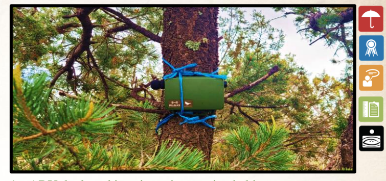
An ARU deployed in prime pinyon-pine habitat.

The pinyon jay occurs in low elevation conifer woodlands on Fort Carrson and has been historically observed on PCMS. Pinyon jays have coevolved with pinyon pines. The jays rely on the trees for food, and conversely, the jays disperse the pinyon seeds. Pinyon jays have been declining at a rate of 2%/year since 1967 (~80% decline). They are a USFWS petitioned species and a DoD missionsensitive species. Bird Conservation Region 16, the region from Fort Carson to Four Corners (UT, AZ, NM and CO), is estimated to have 50% of the population. The MSST has been conducting pinyon jay surveys and mapping their occurrence on the installation. In addition to visual surveys, the MSST has deployed 15 acoustic recording units (ARUs) in prime habitats. Data obtained from the ARUs is analyzed for the presence of pinyon jay calls.