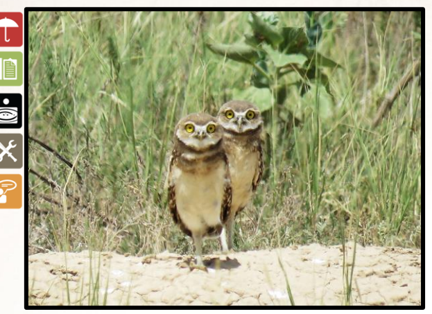
The MSST surveys for, and protects, burrowing owls.

Burrowing owls occur on Fort Carson and PCMS. These miniature raptors are protected under the Migratory Bird Treaty Act (MBTA), listed as a DoD Mission Sensitive Species, and listed as a Colorado State Threatened Species. Since the burrowing owl habitat encompasses a large amount of training area during the nesting season, an ESA designation of this species would have a profound (seasonal) negative impact on the Army training mission. On Fort Carson, these ground dwelling owls primarily nest within active prairie dog colonies. Most prairie dog colonies are in flat terrain within the short-grass prairie where the soil conditions are ideal for digging. During heavy training events, MSST collaborates with Range Control to create buffers around nesting owls. This effort also protects other species of concern that utilize prairie dog colonies including the swift fox, long-billed curlew, black-footed ferrets, mountain plover, and golden eagle.