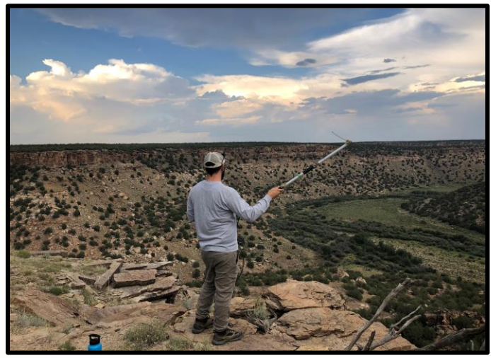
The bat telemetry survey led biologists to new bat roosts.

In addition to the baseline surveys, biologists installed VHF tracking devices on nine bats which led to the discovery of three new roost locations that are now protected. Data from the study enabled the MSST to identify high priority areas (areas with the highest number and diversity of bats). The acoustic sampling data was used to create occupancy probability models for the candidate species. These models will guide management plans if either of these species becomes listed. All captured bats were tested for white-nose syndrome, which was not detected during the study.