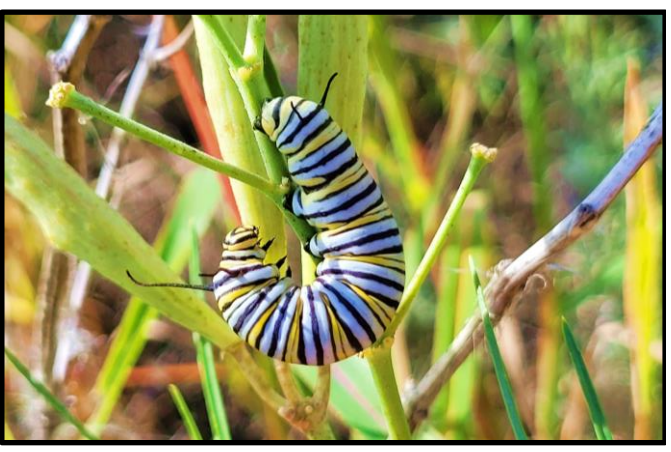
The MSST documented locations of breeding monarchs.

Monarch butterflies are known to occur on Fort Carson. In response to the recent listing of the monarch butterfly as a candidate species, Fort Carson has adopted proactive measures to study and support this species to preclude a species listing. MSST biologists conduct annual surveys and map monarch locations.