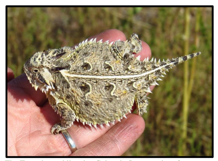
The Texas horned lizard, a Colorado State species of concern, documented on PCMS.

The MSST has partnered with DoD Partners in Amphibian and Reptile Conservation (PARC). While conducting COCW and other reptile surveys, the biologists upload data to the PARC HerpMapper Program for all reptiles encountered. This information sharing between installations is mutually beneficial. The larger set of data enables biologists to identify trends across an entire region and therefore develop more informed management strategies. Additionally, the data sharing effort enables biologists to detect trends that are unique to their installation.