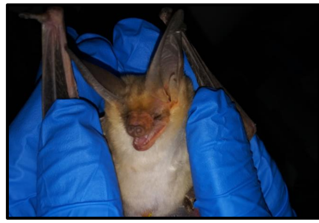
Pallid bat captured during a mist net survey on PCMS. Fort Carson is home to 18 species of bats, including the tricolored bat (a proposed endangered species),