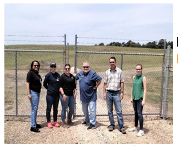
The JRTC & Fort Johnson IRP stakeholders at Chaffee Road Landfill for a maintenance inspection and review.

Fort Johnson Restoration Sites Status Review Meetings – Occurs monthly to maintain information flow between the project stakeholders and state regulators. This ensures any pending actions are accounted for and cleanup processes are on track with path forward ideas and exit strategies maintained.