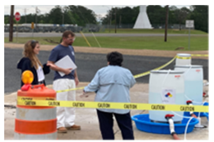
Site inspection of vertical treatment wells around and proximal to exceedance locations installed to deliver material (wash soil) to treat the residual contamination.

and returned to its origin. A project to expand the capabilities of the Fire Station facility to meet new mission requirements led to a PA/SI being initiated in 2007. The SI found petroleum impacts above LDEO RECAP standards in surface soil. To achieve unlimited use (UU)/unrestricted exposure (UE) to support the expanded mission requirements, a corrective measures implementation construction (CMI(C)) work plan was submitted and approved for work start in 2021. With the upgraded Fire Station now operating 24/7 under the expanded facility footprint, it made excavation near impossible without disturbing operations. During the pre-design investigation sampling, results show only two locations exceeded LDEQ RECAP standards. The results made remediation feasible on a smaller scale and disruption to the fire station minimum requiring only two areas needing direct treatment. At each treatment point, direct push technology will be used to drill a boring to approximately 12 feet below ground surface (ft bgs). The gravity fed system can be seen in the photo below and the first round of treatment was completed in April 2023. Monitoring and treatment are ongoing and expected to continue until the beginning of 2024. The site will be closed out to Unlimited Use (UU)/Unrestricted Exposure (UE) standards (clean).