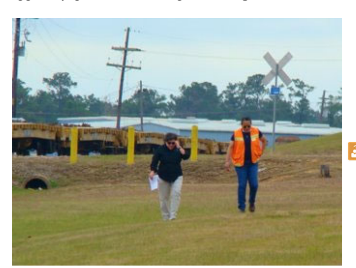
SWMU 26 Site closure inspection with the state regulator. Site returned to natural conditions at an industrial level RECAP standard.