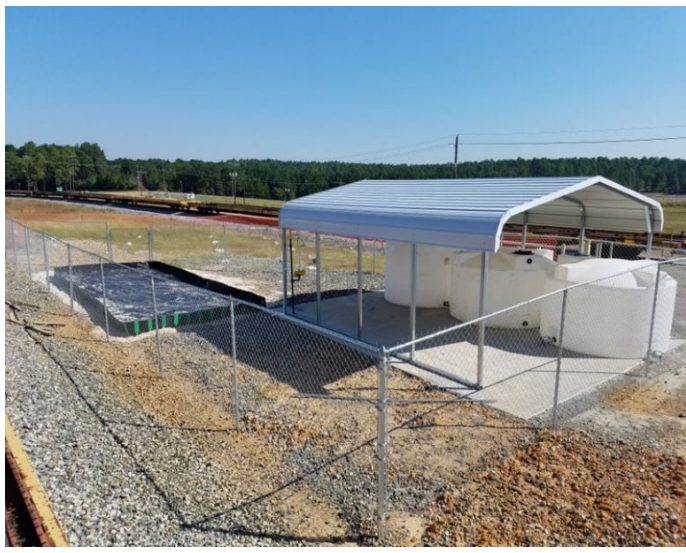
SWMU 26 Site showing the In-Situ Chemical Oxidation setup with temporary wells flagged in upper left prior to closure proceedings.