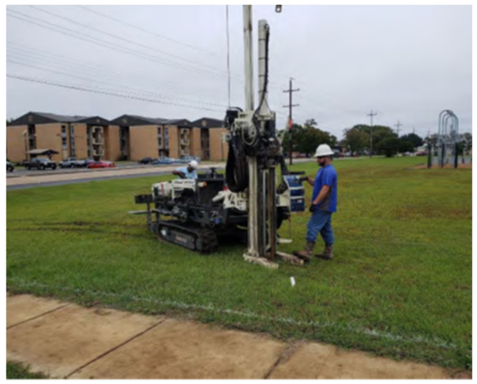
CCBldg 1725 Soil boring installation using Direct Pushing Technology (DPT) rig.

Munitions debris and munitions constituents were found at three former training sites in the early 2000s. A Remedial Investigation and soon after a Feasibility Study were developed and approved by LDEQ but included additional reports to submit due to the presence of munitions and explosives of concern. Though approval was granted for the previous reports, additional closing procedures had to be met to officially call the sites closed. Starting in FY20, the IRP manager and the LDEQ regulator worked together to find the outstanding documents and procedures needed to close these two MMRP sites. The IRP manger ensured the subsurface clearance reports and all other closing documents were submitted to the state and approved. The state provided confirmation documents on previous approved reports so the IRP manager would be able to close out the site for Army real property records. This effort not only supported local, state and federal requirements but legally validated the clean closure of Army real property holdings by the beginning of FY22. This effort by the two agencies working together to meet regulatory compliance and certifying the official closeout of three sites to Unlimited Use (UU)/Unrestricted Exposure (UE) standards (clean) was a job well done.