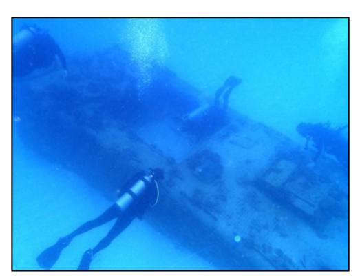
Scientific divers from NOAA and University of Hawaii record a sunken LVTP at MCB Hawaii.

Beginning with World War II, intensive amphibious training activities have left a physical legacy beneath the sea that is often overlooked. Partnering with the National Oceanic and Atmospheric Administration (NOAA) and the University of Hawaii Marine Option Program, MCB Hawaii recorded a sunken landing craft (LVTP) near Pyramid Rock Beach, eliminating a survey that would have cost $50K. Further partnering efforts are underway to record sunken World War II reconnaissance seaplanes in Kaneohe Bay.