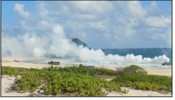
Amphibious training near Mokapu Burial Area on the north coast of Mokapu Peninsula.

In order to help manage historic properties on Mokapu Peninsula, MCB Hawaii executed a Programmatic Agreement (PA) with SHPO and Advisory Council on Historic Preservation (ACHP) for the basing of MV-22 and H-1 Aircraft in support of III Marine Expeditionary Force (MEF) elements in Hawaii. This PA includes a commitment to implement the following mitigation measures: interpretive displays in Hangar 101 (the National Historic Landmark); a people-friendly ethnohistory report;