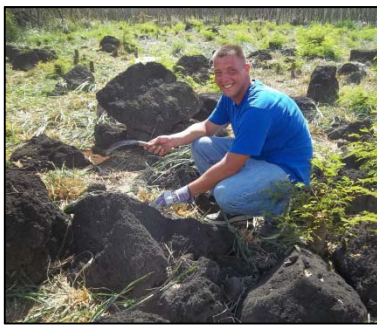
Marine from FAP Program working at Site 7411.

assistance provided by Marines and sailors in the Fleet Assistance Program (FAP), many of whom will be leaving the service. FAPs learn basic database skills, laboratory techniques, and participate in field studies. By becoming part of the Cultural Resources team, they develop an understanding of cultural diversity. These skills help them succeed in their future careers.