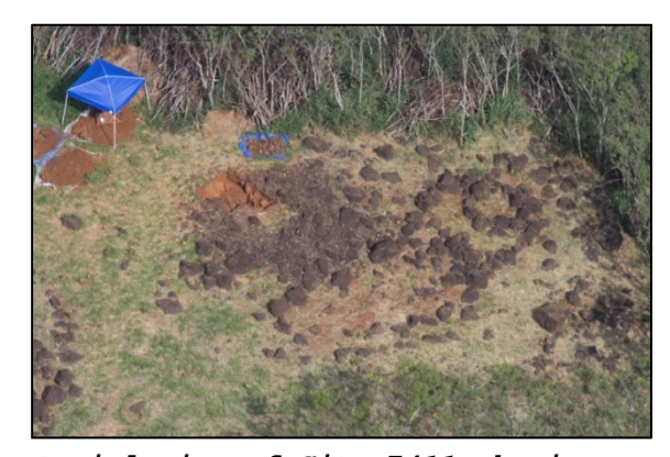
Aerial view of Site 7411 showing archaeological excavations in an ancient house platform.

A successful CRM program includes identification of archaeological sites. Research indicates that most of the lands on which MCB Hawaii installations are located were first inhabited by Polynesians approximately 1,000 years ago. Bellows Field Archaeological Area (Site 511), which covers most of MCTAB, includes habitation sites, lithic (stone tool) manufacturing areas, and burials. A number of World War II features, such as aircraft