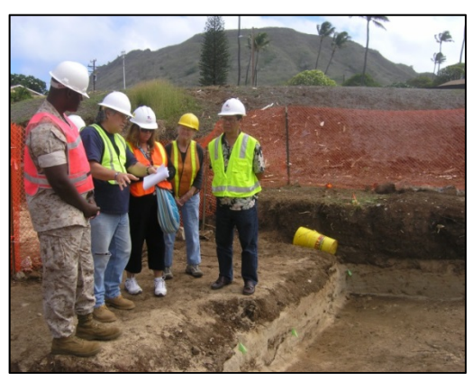
Consultations with NHOs include visits such as shown above to a traditional Hawaiian site.

The CRM program works closely with consulting parties such as the Hawaii SHPO, the National Park Service, ACHP, and Historic Hawaii Foundation. Through consultations with these stakeholders, MCB Hawaii has executed one Programmatic Agreement (PA) and one Memorandum of Agreement (MOA). Two other MOAs are near completion. The consulting parties are participating in the Area Development Plan for the historic Administration District.