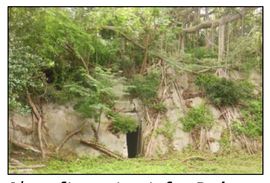
Aircraft revetment for Bombers built during World War II. Personnel shelter entranceway visible.

Although military development began during World War I, major construction did not start until World War II. The built environment helps tell the story of MCB Hawaii's military past. An inventory and context study of the historic buildings was