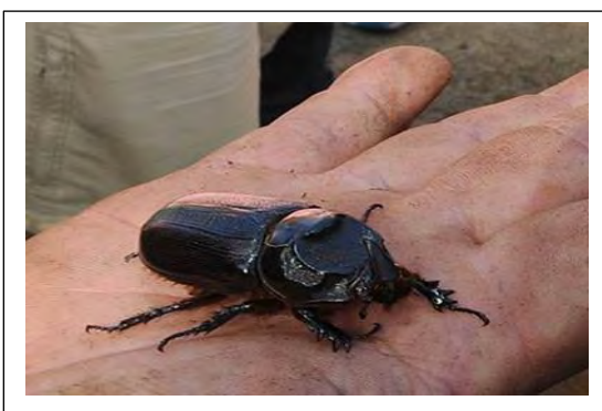
Adult Coconut Rhinoceros Beetle

The first ever breeding population of CRB, a highly destructive pest of palm trees and federally actionable invasive species native to Southeast Asia, found in the Hawaii Islands was discovered on JBPHH in December 2013 in mulched green waste along a fence line with Honolulu International Airport. It is suspected that the first beetle arrived as a stowaway aboard an International flight, and although it is