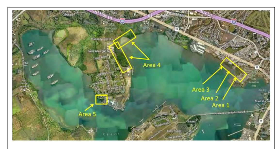
Areas of Mangrove Removal

water on the airfield which attracts birds) and providing habitat in the canal itself, away from the airfield for wading birds. Later in FY2013 and FY2014, JBPHH funded a much larger contract, approximately $1,000,000, for mangrove removal in other parts of Pearl Harbor. JBPHH was again able to achieve multiple goals by funding this project – it improved its own security in these areas, it strengthened relations with the community in these areas by making them safer and opening up harbor views, and it improved endangered bird habitat. Shortly after mangrove were removed in Area 4, a pair endangered Hawaiian stilts built a nest. Additionally it was common to see native sedges and other Hawaiian plants sprouting up after mangrove removal.