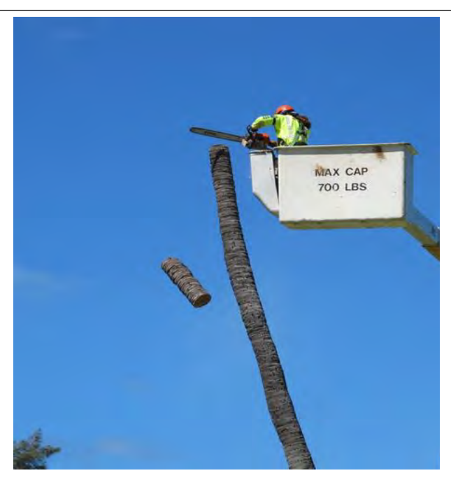
Approximately 150 infested or damaged Coconut palm trees were removed from the base in an effort to stop the spread of the CRB

From December 2013 through September 2014, in total JBPHH composted approximately 80 tons of infested mulch and burned approximately 20-30 tons of whole green waste. When added to tree cutting and trap monitoring costs, the total amount spent during this period was $1,453,228. As stated above, this figure is lower than it might have been had JBPHH not proactively sought practical and cost effective solutions. Furthermore, as the CRB infestation affects Army and Marine Corps properties on Oahu, the protocols and methods developed at JBPHH have been shared with and adopted by these other services. The USDA and State of Hawaii have given great praise to JBPHH for supporting the CRB eradication effort and have viewed their partnership with JBPHH as a great success. CRB has the potential not only to have a disastrous effect on Hawaii's iconic non-native coconut palms, but also on endemic species of native Hawaiian fan palms, some of which are federally listed as endangered. For these reasons, CRB eradication is and extremely high visibility action, and JBPHH has done an excellent job of making its involvement so far a good news story for the DoD.