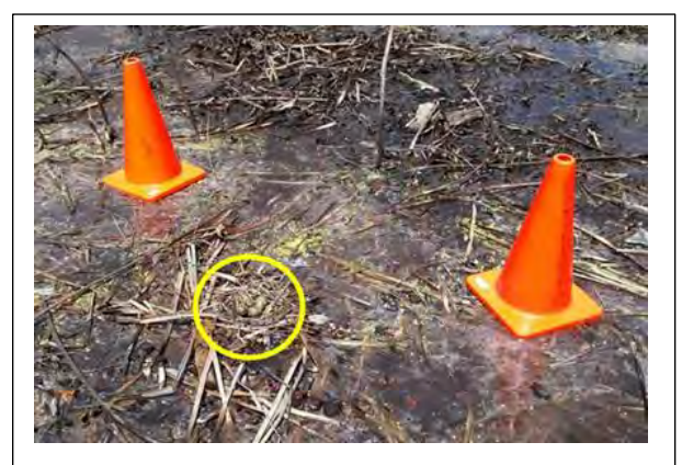
Endangered Hawaiian Stilt nest on a site of previously cleared mangrove

requirement from a previous Biological Opinion from