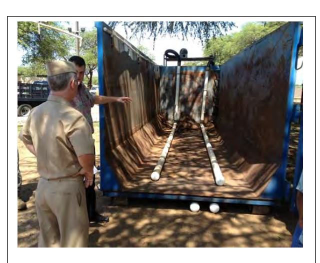
In-vessel composting. Developed at NAVFAC Hawaii as a means to "cook" green waste at temperatures above 140 deg