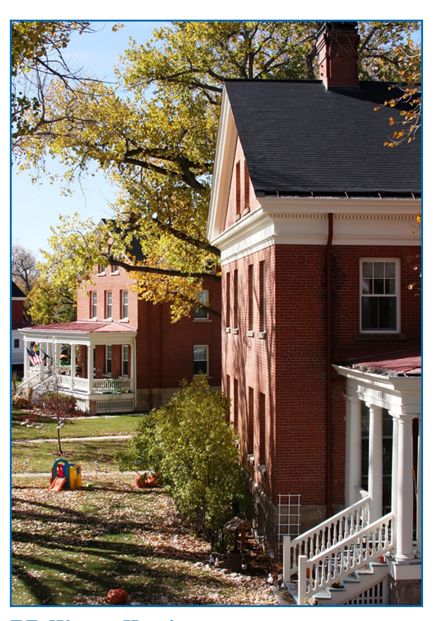
F.E. Warren Housing

Military installations remain the home of combat power, and F.E. Warren AFB is no exception. No other aspect of the mission impacts military families' lives more directly than ensuring they receive world class housing and community facilities. To accommodate MHPI at F.E. Warren AFB, the CRM developed a comprehensive PA through partnerships with the Advisory Council on Historic Preservation (ACHP), the Wyoming State Historic Preservation Office (WYSHPO), the Alliance for Historic Wyoming (AHW), the MHPI Developer and the Air Force Legal Operations Agency (AFLOA). This stakeholder-driven approach resulted in a PA that sensibly governed the treatment of 157 historic housing units, historic landscapes and sundry other cultural resources.