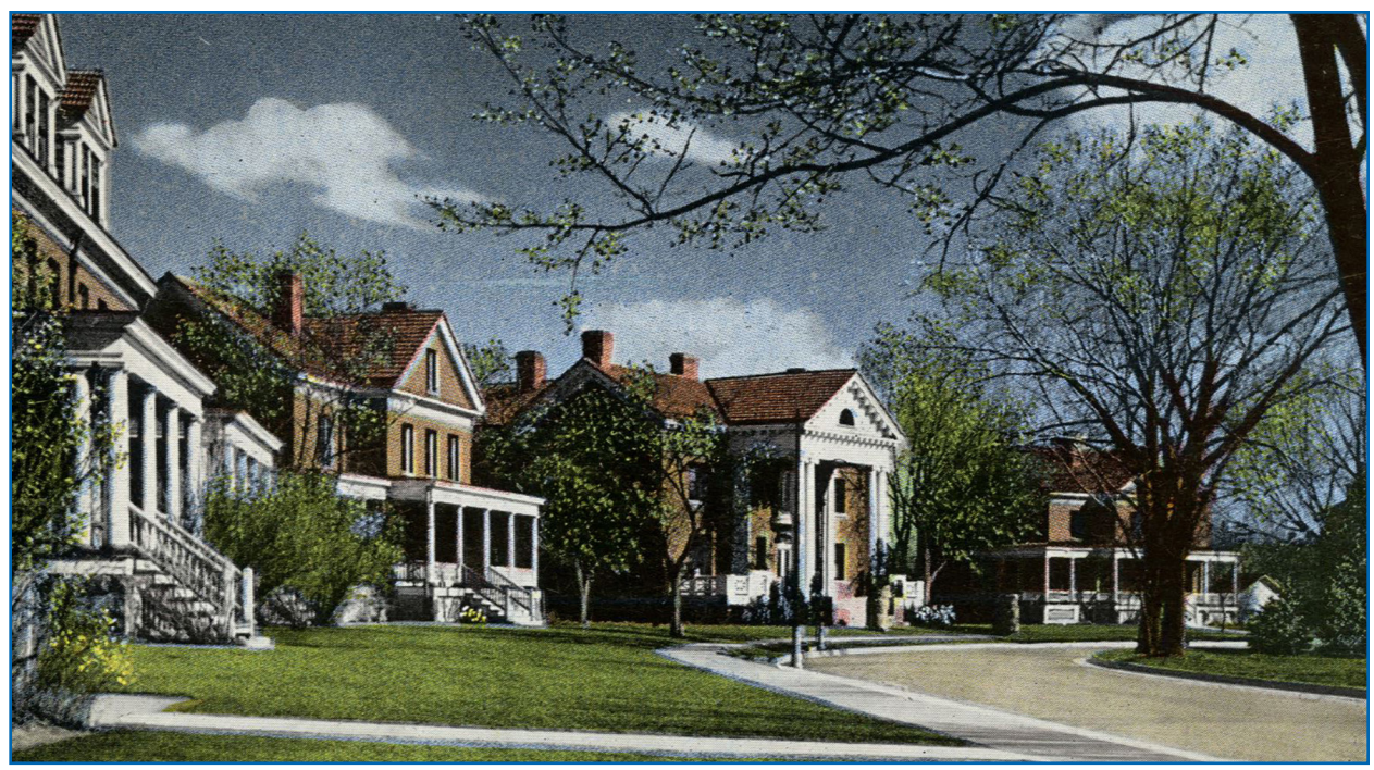
F.E. Warren AFB Historic Postcard

F.E. Warren AFB is the oldest installation in the USAF inventory. Originally founded in 1867, the installation strongly reflects its frontier roots. F.E. Warren AFB also embodies its modern-day mission to provide the world's premier combat-ready ICBM force.