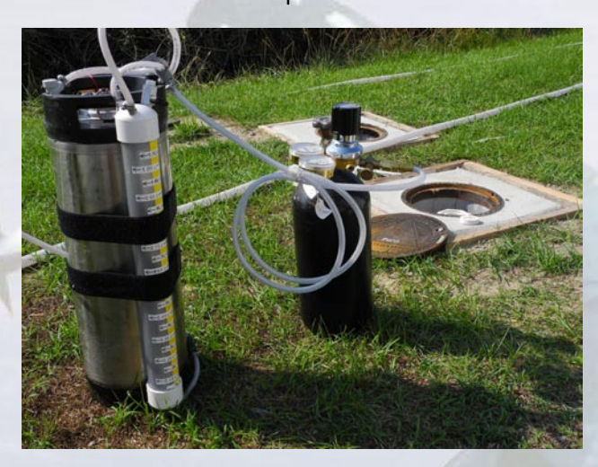
Injection of the Bioaugmentation Culture into surficial groundwater wells to accelerate biodegradation of VOCs

tetrachloroethene (PCE) and it's daughter products into the non-harmful end product ethene.