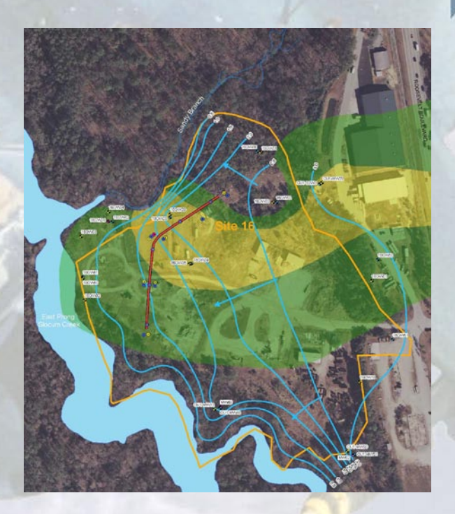
Site location and orientation of the PRB to intercept migrating groundwater prior to discharge to Slocum Creek.

PRBs are passive groundwater treatment systems that create a subsurface zone to treat contaminants dissolved in groundwater as they flow through. The PRB technology relies on natural hydraulic gradients to bring contaminants into the reactive treatment medium which would ideally be positioned perpendicular to the groundwater flow.