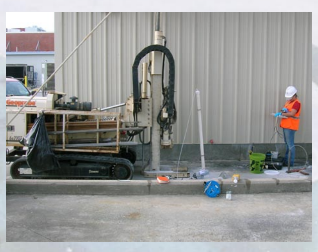
Installation of Soil Vapor Probes during Phase 1 of the VI Investigation

and soil-vapor sampling. A review of the Phase 1 sampling results highlighted 14 buildings that would require an additional Phase 2 investigation due to possible Vapor Intrusion pathways.