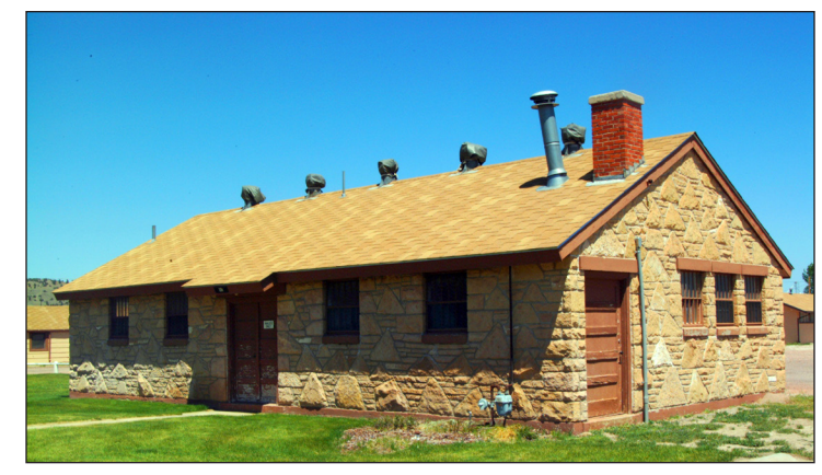
Building 301 is an excellent example of the unique historic stonework in Camp Guernsey's cantonment area constructed with locally quarried sandstone as a Works Progress Administration project in the New Deal era.

Camp Guernsey has evaluated all buildings for historic and architectural significance, including their status under Cold War-era criteria. Real Property Historic Preservation Codes are current and accurate. A total of 37 buildings in the Camp Guernsey Cantonment Historic District are at least 50 years old, and 29 are eligible for the National Register of Historic Places. The National Registereligible historic district was constructed during the New Deal era with Works Progress Administration labor. The 75th anniversary of the New Deal took place in 2008, and the CRM office developed a presentation highlighting the locally quarried sandstone structures built during that period. An educational poster visually displays the differences in stone masonry techniques between the beginning of Camp Guernsey's construction in 1939 (using cut stone blocks carefully laid in horizontal courses) and construction after January 1941 (when random rubble stone was laid in irregular patterns to increase the speed of construction because of the threat of war).