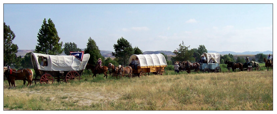
Camp Guernsey's Oregon Trail resources provide a unique opportunity for public interaction and education. Trail reenactments, like the one pictured above, are conducted across Camp Guernsey lands.

Eastern Shoshone, Fort Peck Assiniboine and Sioux, Kiowa, Northern Arapaho, Northern Cheyenne, Northern Ute, Oglala Sioux, Rosebud Sioux, Shoshone-Bannock and Sisseton-Wahpeton Oyate. Meetings feature program updates, information sharing, discussions of management recommendations, project reviews and site visits. The 2009 tribal consultation meeting included a field trip,