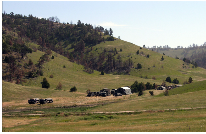
Camp Guernsey is a preferred major training area for deploying combat units due to its similar landscape found in Afghanistan. Here, the WYARNG's 115th Fire Brigade has established a logistical supply area in the draw during an annual training period in June 2008.

The foresight in the completion of cultural resource surveys conducted under Section 110 of the NHPA has allowed numerous construction and training projects to occur without mitigation efforts. In