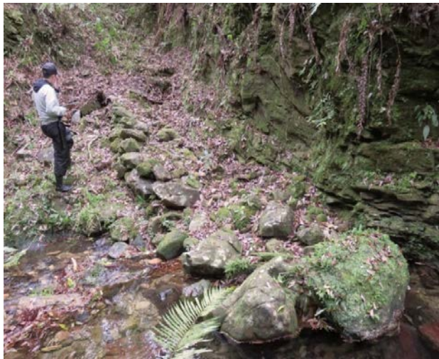
Archaeologists document a stone-lined trail during the Haramata Watershed Survey.