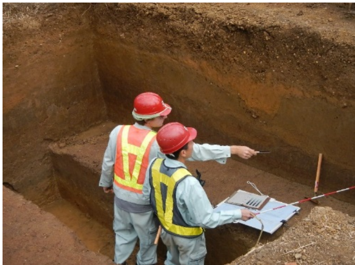
Archaeologists conducting excavation at Ie Shima Training Facility.

academic knowledge about Okinawan history as a whole.