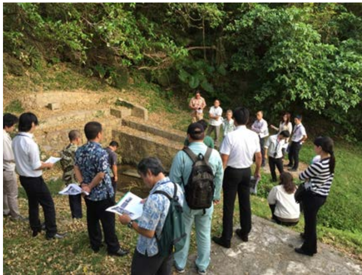
Members of OPG gathered at Chibuga Spring on Camp Foster to learn about how MCB Butler is preserving critical Okinawan cultural assets.

The MCB Butler Cultural Resources Management Program has forged numerous collaborative partnerships with various local and government agencies. Because the boundaries of MCB Butler cross into several local municipalities, our Cultural Resources Management Program coordinates with twelve individual Boards of Education, which oversee municipal cultural resources and assets. Throughout FY16 and FY17, the Cultural Resources Management Program conducted five separate Board of Education consultations on four different projects where significant cultural resources exist. During one coordination effort, MCB Butler's Cultural Resources