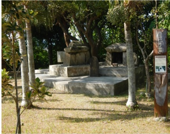
Chatan Gusuku, located on Camp Foster, is one of the many culturally significant sites aboard MCB Butler.