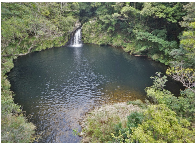
The location of this isolated pool, known as "Toshingumui" in historical records, was verified during the Sannumata Watershed survey.

During FY16 and FY17, the Cultural Resources Program conducted extensive surveys to inventory the cultural resources under its stewardship and maximize efficiency in the management of those resources.