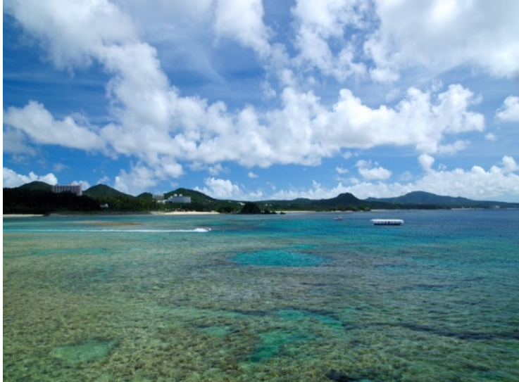
The island of Okinawa, Japan is a key training location for the Marine Corps.

Marine Corps Base Camp Smedley D. Butler (MCB Butler), located on the island of Okinawa, Japan, is a dynamic collection of widely dispersed installations and training areas, creating a