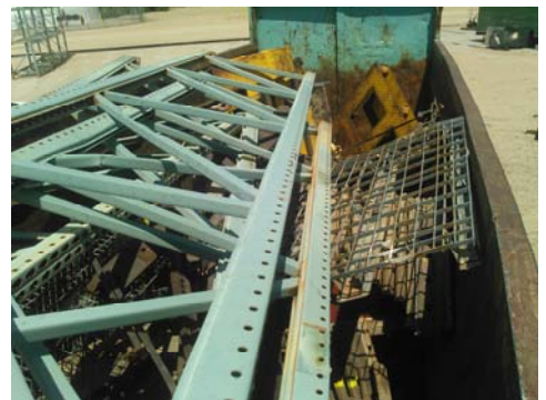
Five tons of scrap metals collected for recycling pick-up.