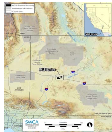
Marine Corps Logistics Base Barstow boundaries in relation to surrounding communities.

Marine Corps Logistics Base (MCLB) Barstow is located in the high desert of western San Bernardino County, California. The base includes a diverse collection of large training areas and range areas encompassing 5,567 acres within the DoD Southwest Range Complex, and supports approximately 95 military personnel and their families and 1,840 civilian employees. MCLB Barstow is separated into three functional areas. Nebo Main is a large training area, also known as a cantonment area, that houses the MCLB Barstow headquarters and tenant logistical capabilities. Yermo Annex is an industrial repair and storage complex that is home to DoD's largest rail facility. The Annex primarily hosts tenant activities and supports Marine Corps and Army rotations to the National Training Center at Ft. Irwin and the Marine Corps Air Ground Combat Center at Twentynine Palms. There is also a range on the southern edge of Nebo Main that includes a live-fire known distance range complex and open training area. Key functions of the base are to receive, store, and distribute supplies and equipment, and to repair and rebuild DoD equipment in direct support of the U.S. military mission worldwide. MCLB Barstow supports the Marine Corps mission with comprehensive compliance, pollution prevention, conservation, planning, training, and management activities.